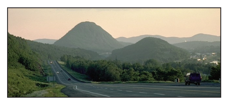
The erosional remnants of an Early Devonian volcanic pipe from the Tobique-Chaleur Bay Belt, Sugarloaf Mountain, Campbelton, New Brunswick. Photo credit:

the Earth began cooling, leading into Chapter 8, Into the Quaternary Ice Age. In addition to the effects of the Ice Age on landscapes and life forms, another factor to consider is the rise and fall of sea level and our changing coastlines. The earliest humans arrived about 12,500 to 9500 years ago, and left behind several important archeological sites, mainly along waterways. Box 9: Between Land and Sea describes the everchanging coastline, including the significant environmental role of coastal marshes, and how humans are affected by and play a role in causing erosion and altering the coastlines.