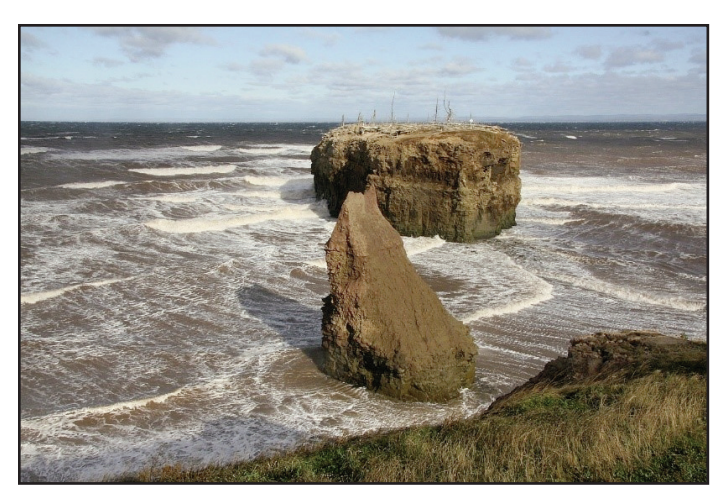
Sea stacks formed from Carboniferous sedimentary rocks under attack from stormy weather, Pokeshaw, New Brunswick.

growth rings of Devonian corals indicating that the length of a day was then only 22 hours long!