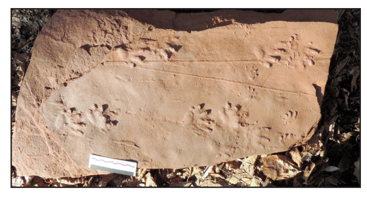
Trackway of a Permian tetrapod (a four-legged animal) on a sandstone block discovered in Lord Selkirk Provincial Park, Prince Edward Island, dating from about 290 million years ago.

The puzzle pieces of the geological stories are pulled together starting in Chapter 4, Into Deepest Time. The processes involved in producing the first land masses, to the first life forms and banded iron formations, build on previously explained concepts. The growth and demise of supercontinents to microcontinents, along with changing oceans are framed within the rock formations of the Maritime Provinces over time, with many local examples given. Box 4: Rock Stars illustrates the key discoveries and life stories of several prominent individuals who made exceptionally noteworthy contributions to Maritime geology and geoscience education. Chapter Five, The Pieces Come Together, further explores the significant tectonic, climatic, and biotic changes from the Proterozoic and Cambrian to the Devonian, setting the stage for the introduction of the Carboniferous - a particularly rich period of the ancient Maritimes. Box 5: Granite is an analysis of the granite batholiths and related features found as distinct landforms, such as the South Mountain Batholith in Nova Scotia, and the