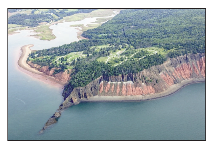
Aerial view of the cliffs at Five Islands Provincial Park, Nova Scotia, showing a faulted block of Late Triassic North Mountain Basalt (dark grey), Early Jurassic fluvial and lacustrine red sedimentary rocks (left of the faulted block) and Late Triassic lacustrine red sedimentary rocks (right of the faulted block) overlain by North Mountain Basalt.

Pokiok Batholith in New Brunswick. Box 6: Fish Tales goes through the evolution and classifications of fishes, linking certain specimens to various Maritime localities. Chapter Six, Basins and Ranges, describes the development of the coal fields, from the changing seas and climate - producing a great "drying off" (creating the red soils of Prince Edward Island for example) to the greatest known extinction of approximately 90% of all living organisms. Box 7: Old Salt and Lime relates to the impacts of these times of great aridity, while Box 8: Flowing Through Time describes the effects of fluvial environments on both landforms and organisms, including human habitation impacts. Chapter Seven, An Ocean is Born, shows how the North Atlantic Ocean grew over time during the breakup of Pangea, and makes connections to the Mesozoic to Cenozoic rocks formed across the region. Some of the basalt flows that heralded the birth of the Atlantic Ocean contain many types of zeolites, and the Bay of Fundy is a world-famous site for collecting these minerals. Several extinction events took place during these times and the extraordinary fossil evidence for one of them is found in several key locations in the Maritimes, especially the "Fundy Fossils" section. During the Cenozoic,