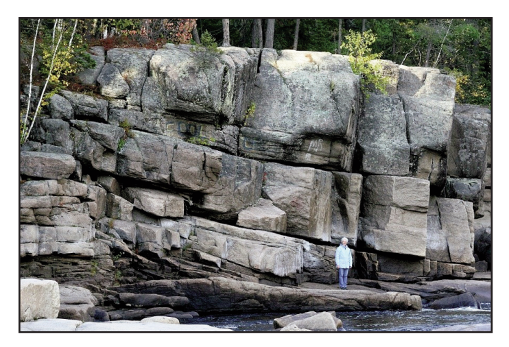
Typical subhorizontal joints (prominent fractures) in granite at Pabineau Falls, New Brunswick, caused by release of pressure over time as overlying rocks were removed by erosion.