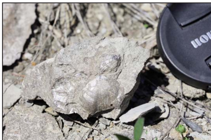
Brachiopod fossils at Hungry Hollow, Arkona, Ontario.