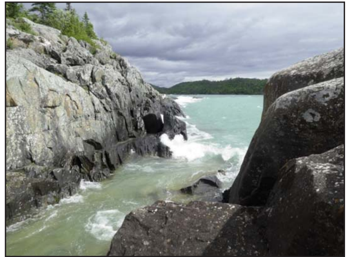
Pukaskwa dyke (~ 1106 Ma) intruded along plane of weakness in deformed Archean pillow basalt (in left cliff face).

This field trip will focus on ca. 1140–1105 Ma volcanic and intrusive rocks related to the Early Midcontinent Rift, emplaced onto or into the Archean terrane northeast of Lake Superior. Because we are virtual, we can visit many of the best outcrop exposures located off the beaten path, from the spectacular Lake Superior shoreline to as far east as Timmins. We will look at a very diverse range of alkaline and tholeiitic igneous rocks with planned stops at: 1) Chippewa Falls and Mamainse Point to see pahoehoe lava flows and interflow conglomerates, 2) Rift perpendicular dykes including the Great Abitibi and Kipling dykes, 3) Rift parallel alkaline dykes in Pukaskwa National Park, 4) interlayered alkaline and tholeiitic basalt at Penn Lake, 5) the Coldwell Complex, the largest alkaline intrusion in North America, to see partial melting at the Archean footwall contact and classic intrusive relationships between nepheline syenite and alkaline gabbro at Neys Provincial Park, and 7) Pebble beach in Marathon. We will finish the field trip by examining some of the highly unusual but distinguishing igneous textures at two of the best-known copper-palladium deposits located in the eastern Midcontinent Rift, i.e. the Geordie Lake and Marathon deposits within the Coldwell Complex.