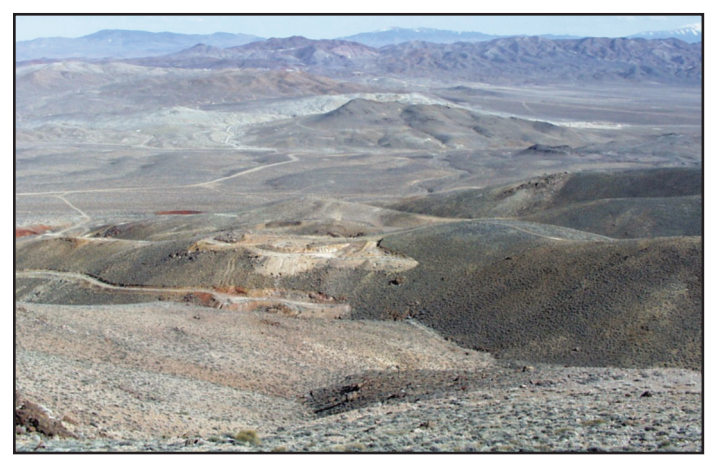
Yerington, Nevada – View from lithocap to porphyry across 3 fault blocks.

South of the 49<sup>th</sup> parallel, another 2.5-day field trip titled "Navigating a porphyry Cu hydrothermal system: Alteration and geochemical dispersion mapping" will examine the geology, hydrothermal alteration mineralogy, and geochemical dispersion around Yerington, Nevada, USA. Yerington is a classic locality where porphyry Cu deposits, high level Fe-oxide deposits, and a volcanic and plutonic complex have been tilted 80° on to their side so that a complete 3-D picture of a zoned magmatic-hydrothermal system is exposed.