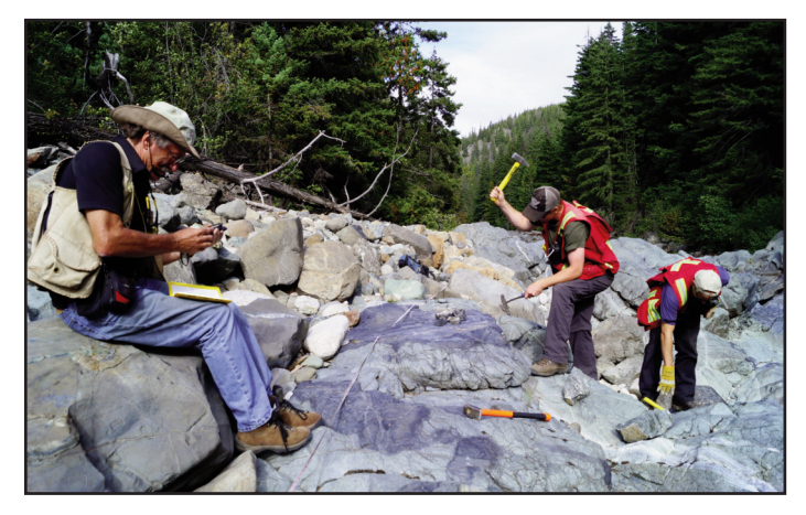
Dunite-clinopyroxenite outcrop in the Tulameen River bed, near Tulameen, British Columbia.

The other four-day field trip titled "Torrents, Terrains and Tuyas-Waterfall and Volcanoes of South Central British Columbia" will highlight BC's magnificent mountain scenery, provincial parks, volcanoes and especially its water falls. The trip is suitable for the specialist and non-specialist alike. The group will investigate a zone of transition between the Cariboo and Monashee mountain ranges where deep crustal faults have provided pathways for mafic magmas producing the Wells Gray-Clearwater volcanic field. Here, the interaction between volcanism and multiple glaciations over a three-million-year period have created rugged terrain and unique subglacial landforms called 'Tuyas.' River valleys cut the landscape. The vertical lava walls create spectacular water falls, including Canada's fourth highest - Helmcken Falls. In addition to the stunning vistas, there will be opportunity of hands-on examination of complex stratigraphy related to volcano-glacier interaction.