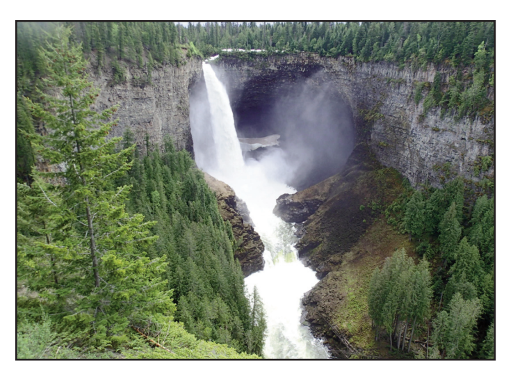
Helmcken Falls cutting through Wells Gray-Clearwater volcanic field; Wells Gray Provincial Park in south-central British Columbia.

The other four-day field trip titled "Torrents, Terrains and Tuyas-Waterfall and Volcanoes of South Central British Columbia" will highlight BC's magnificent mountain scenery, provincial parks, volcanoes and especially its water falls. The trip is suitable for the specialist and non-specialist alike. The group will investigate a zone of transition between the Cariboo and Monashee mountain ranges where deep crustal faults have provided pathways for mafic magmas producing the Wells Gray-Clearwater volcanic field. Here, the interaction between volcanism and multiple glaciations over a three-million-year period have created rugged terrain and unique subglacial landforms called 'Tuyas.' River valleys cut the landscape. The vertical lava walls create spectacular water falls, including Canada's fourth highest - Helmcken Falls. In addition to the stunning vistas, there will be opportunity of hands-on examination of complex stratigraphy related to volcano-glacier interaction.