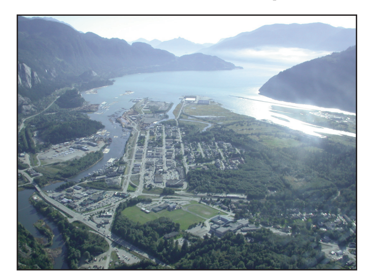
Howe Sound, a network of fjords northwest of Vancouver, British Columbia.

An underground tour of the Britannia Mine, once the largest mine in British Columbia, is included in the trip.