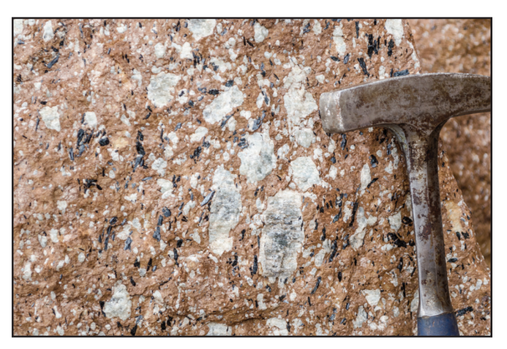
Upper Fir carbonatite – apatite and ferrikatophorite in a Fe-dolomite matrix; southeastern British Columbia.

Another three-day field trip within southeastern BC titled "Upper Fir Carbonatite-Hosted Nb-Ta Deposit" visits the Upper Fir carbonatite complex (330 Ma) hosting one of the largest and best studied Nb-Ta deposits within the Omineca belt of east-central British Columbia (Blue River area). Although the late Paleozoic carbonatites formed in an active tectonic setting, they are mineralogically and isotopically indistinguishable from worldwide carbonatites generated by deep-mantle plumes in intracratonic settings. Participants will examine late Paleozoic pillowed basalts along the way to Blue River and a range of metamorphic rocks and structures at Upper Fir. In a wider context, the trip will evaluate back-arc extension from eastward subduction beneath ancestral North America and its possible connections to mantle plume development that may have triggered formation of the Slide Mountain ocean.