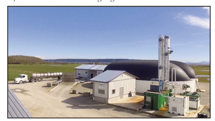
Seabreeze Farm Renewable Natural Gas plant, Delta, British Columbia (Photo: Greenlane Biogas).

A third one-day field trip titled "Seabreeze Farm Renewable Natural Gas Plant Tour" will examine a multi-generational family owned dairy operation in Delta, BC that produces Renewable Natural Gas (RNG) from the farm's dairy manure for injection into the FortisBC gas grid.