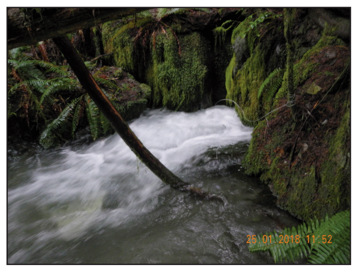
Karst spring, Quadra Island, British Columbia.

Across the Salish Sea, a two-day field trip titled "Karst Hydrology of Central Vancouver Island" will examine two forested karst areas including: the Horne Lake Caves Provincial Park and Quadra Island. The focus for the field trip will examine how these karst landscapes influence the hydrology of the region. At Horne Lake Caves participants will explore the 'karst trail' and have a guided trip into the subsurface. Karst features and geology outside of the park will also be examined. At Quadra Island they will visit a series of karst springs as well as the associated recharge area.