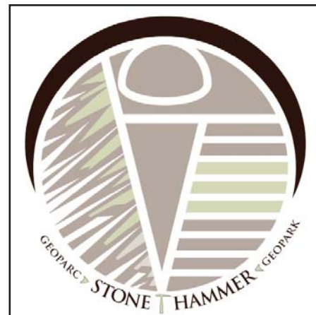
Figure 1. Stonehammer Geopark recognizes its history of geological and palaeontological exploration.

This trip will visit the Precambrian and Cambrian terrane contact at the Reversing Rapids (Fig. 2), a site better known for high tides of the Bay of Fundy that push the river back-