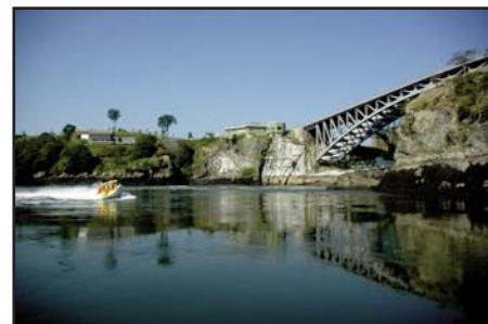
Figure 2. Terrane contact at the Reversing Rapids. Light grey marble of the Neoproterozoic Green Head Group (Brookville Terrane) below the bridge and dark grey shales of the Cambrian-Ordovician Saint John Group (Caledonia Terrane) downriver.

wards. The gorge at Reversing Rapids was visited by Charles Lyell in 1852 where he marvelled at the tidal phenomenon and visited the graphite mines that were then following seams in the Precambrian marble. Not far