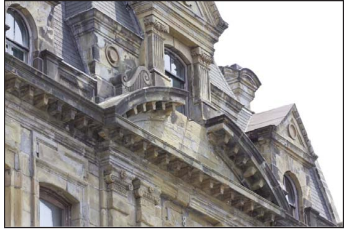
Figure 5. Building stones in Uptown Saint John connect the community to its history of a dimension stone industry.

restrial paleontologist Marie Stopes, working on behalf of the Geological Survey of Canada, determined the age of shales made famous in 1868 by Charles Fred-