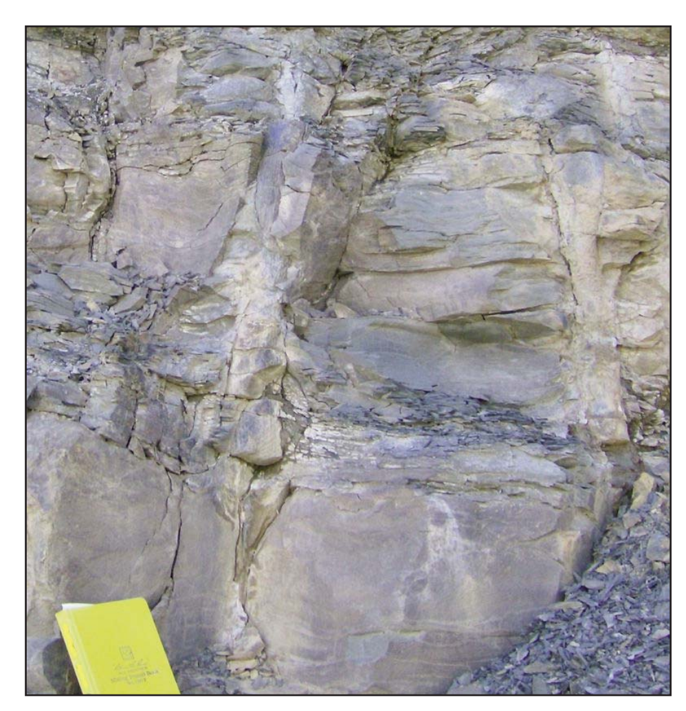
Figure 1. Tournaisian upright trees, Norton fossil forest, New Brunswick.

Over three days, this excursion will offer participants the opportunity to visit spectacular Carboniferous outcrops of palaeontologic, sedimentologic and structural interest in southern New Brunswick. The Norton fossil forest (Fig. 1) contains upright tree trunks smaller, but considerably older than at Joggins. Near Sussex, soft-sediment deformation (slumping) of shale and oil shale is visible over several magnitudes, with these strata overlain by coarsening upward lake shoreface