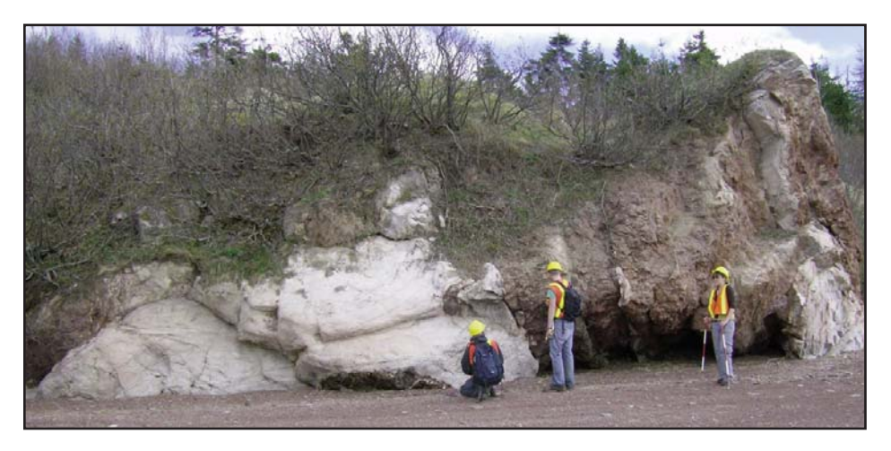
Figure 3. Outcropping deformed gypsum associated with salt diapirism, Maringouin peninsula, New Brunswick.