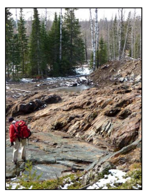
Figure 1. Typical exposure of the ore zone at the M2 site in the Mayville intrusion.

The 3-day trip is based at the Wilderness Edge conference centre at Pinawa (100 km east-northeast of Winnipeg). It will depart from Winnipeg directly after technical sessions on May 24 and return on the evening of May 27. A moderate level of physical activity is involved (at least 1-3 km daily) and sturdy footwear and raingear are recommended. Parts of the Mayville intrusion may not be accessible because of high water levels, in which case an alternative itinerary will be run.