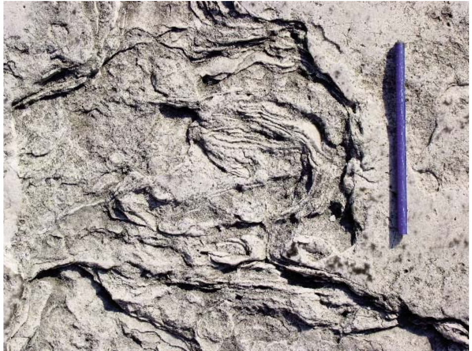
Figure 2. Biofilm structures in quartz arenite of the Nepean Formation showing a bedding-parallel view of crumpled sheets of quartz sand. These layers are inferred to have been bound by cyanobacterial mats between the sand layers, now degraded to carbonaceous wisps. The site on Highway 417 at Terry Fox Drive in Ottawa is a designated Ontario Area of Natural Scientific Interest.

As a consequence of work commenced during the summer of 2008 to add lanes to the Queensway, all outcrops within the median at the Terry Fox ANSI site will be destroyed to provide space for two new lanes. On becoming aware of this planned highway widening the author, on behalf of Friends of Canadian Geoheritage (an organization sponsored by Canadian Geoscience Education Network), contacted key officials of the Ontario Ministry of Transport, Ontario Parks and Ontario Ministry of Environment. In a meeting with these officials in 2003, a 'geosalvage operation' was deemed feasible, subject to expression of interest from museums, universities and other organizations in securing blocks for public display. Representatives of Waterloo University, Carleton University, University of Ottawa, St. Lawrence University, Canadian Museum of Civilization, and the Town of Mississippi Mills all indicated interest in receiving one large specimen each from this site. With interest thus established, approval was granted for removal of up to 10 large blocks by jackhammer and hand-operated pry bars, rather than by blasting the rock.