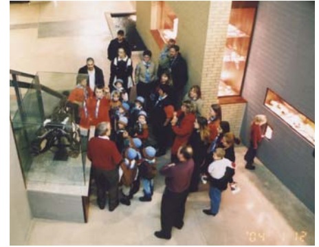
Figure 4. Beaver Group visit.

A popular hands-on activity is the fossil-fish dig. This involves using dental picks to carefully excavate fossil fish,