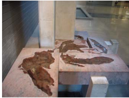
Figure 2. Great Lakes Fountain in the March Networks Exhibit Atrium.

The building's atrium is open seven days a week and houses many exhibits, including a replica Tyrannosaurus rex skull, a wall-mounted reproduction Parasaurolophus skeleton, various mineral exhibits, and an 8.5 x 1.52 x 0.53 m, 1.2-billion-year-old granite gneiss monolith from the Allstone Quarry in Northern Ontario. There is also a gneiss fountain, which is a schematic representation of water flow through the Great Lakes (Fig. 2). A gallery located adjacent to the atrium (Fig. 3) is the venue for talks to visiting groups and houses more exhibits, such as a replica Albertosaurus skeleton, an original cave bear skeleton, and a diorama recreating the environment represented in the Cambrian Burgess Shale in British Columbia. This space is open during regular university business hours.