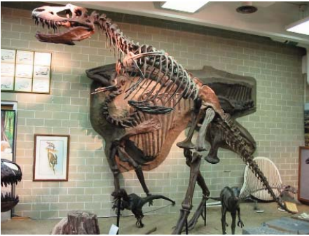
Figure 1. The Earth Sciences Museum before moving to the new space in 2003.

23 donated specimens representing various Ontario geological formations. It was renamed The Peter Russell Rock Garden , in honour of the museum's curator, in 1999, and now contains over 50 specimens from all over Canada and parts of the United States.