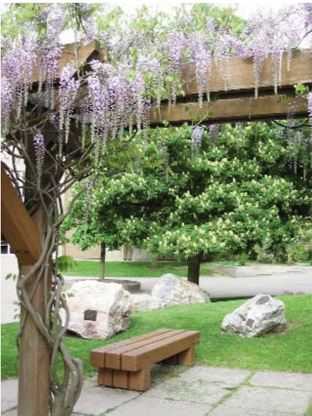
Figure 6. Peter Russell Rock Garden.

very large, ranging from 50 kg to 5 tonnes, and cover a vast span of geological history, from an Archean banded iron-formation boulder from Timiskaming, ON, to quartzite from Desbarats, ON that exhibits striae engraved by a Pleistocene glacier. The rock garden is also a popular spot for faculty, staff and student lunches and coffee breaks, allowing informal learning to take place.