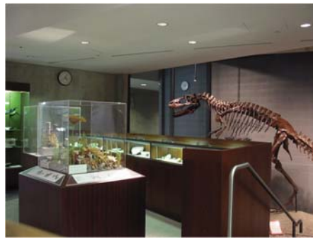
Figure 3. The Conestoga Rovers Learning Centre.