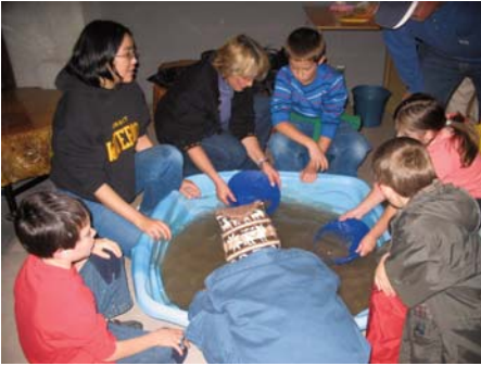
Figure 5. Gold panning at the University of Waterloo Gem Show.