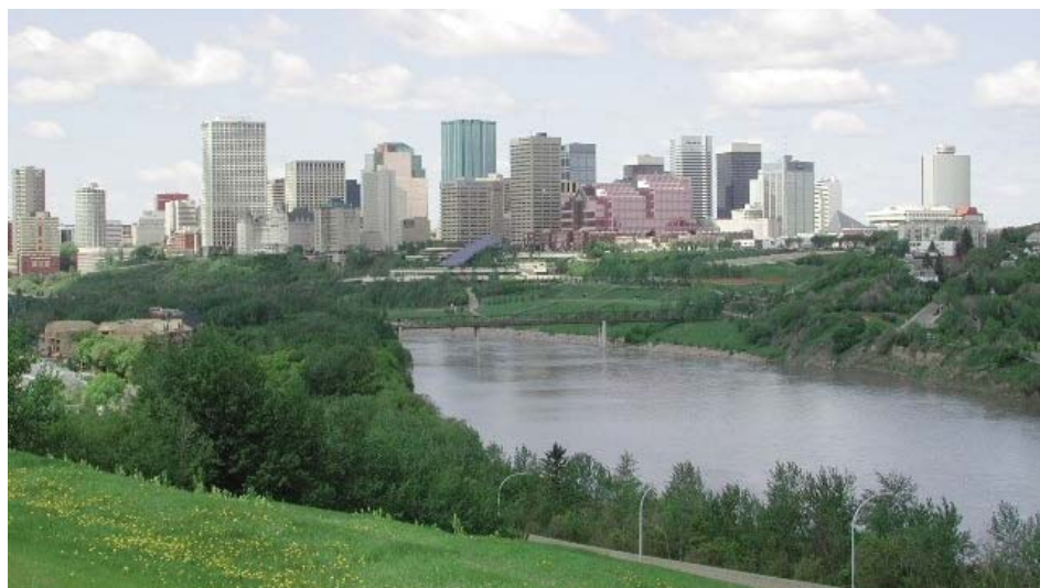
Figure 1. The obvious geological features of Edmonton are the North Saskatchewan River (gold, landslides, outcrop) and the buildings (building stones from around the world).

Some geologists are reluctant to lead a fieldtrip or workshop because it may cover topics they have not studied since they were at university. Over my thirty years of public lectures, workshops and fieldtrips, questions were posed that I could not answer, but in only one instance did a participant know much more about the topic. He was a grade three student in my son's class whose granddad operated a rhodochrosite quarry. This eight year-old expert kindly described the mineral for us and presented me with a polished specimen that I have to this day. I have had the pleasure of receiving assistance from professional experts in paleontology, mineralogy, structural geology and stratigraphy on some of my fieldtrips. Although it was reassuring for me to know that the information delivered was accurate and cutting edge, I sometimes found myself acting as translator between the specialist and the group. As leader, I had formed a bond with many of the participants that depended more on my ability to communicate at an appropriate level than on my qualifications. It was also apparent that participants were more often inspired through observation and activity than by a lecture; for example, I knew that they really recognized gold flakes or saw a pattern take form as a fossil when their faces would break