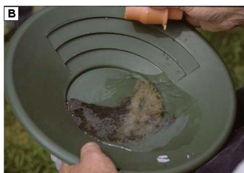
Figure 6. A. The author explains to a group of planners and environmentalists how to pan gold. B. A typical pan with lots of magnetite, garnet and quartz and anywhere from 10 to 125 flakes of gold.

as a by-product of the gravel mining operations just northwest of Edmonton. Every spring flood brings a new layer of flour gold and amateur prospectors and recreational gold panners always strike it rich.