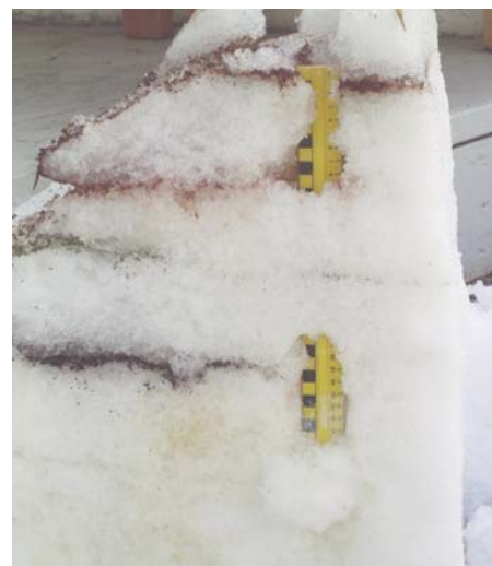
Figure 2. Snow bank with, from bottom to top, coffee, chives, chili and cinnamon layers.

ral snow banks and speculate on how these relate to specific events? A snow bank is an effective way to explain and illustrate stratigraphy and time; it presents an opportunity to run long or short, natural or artificial experiments. Figure 2 shows the snow bank I built behind my deck. At the end of each snowfall or load of snow, I spread a common colourful material over the surface: I used ground coffee and cinnamon, dried chives and chili powder. I recorded the date and time each powder layer was deposited. At the end of the experiment I cut a core into the snow bank, and then cut the snow bank in half. In both the core and the