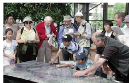
Figure 5. A mixed group of teachers, geologists and children slide magnets across this polished rock slab to find the blebs of magnetite. Sodalite gives the rock a blue colour.

Indiana Limestone that even some geologists assume, at first glance, to be artificial. Indiana Limestone is the stone used for the carvings we see in a number of downtown Edmonton buildings.