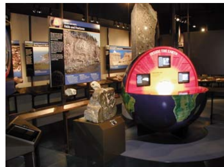
Figure 4. Dynamic Earth explained in Our Planet exhibit.

The pre-eminence of the sun and its influence on our planet are acknowledged; the rock and water cycles highlighted; weathering and weathering products shown; and mountain uplift depicted to continue the theme of Earth's dynamism (Fig. 4). Explaining the Earth's internal heat