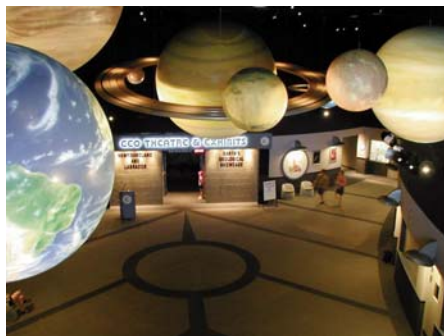
Figure 3. Reception Hall and Geo Theatre. The main Exhibits Gallery is behind the Theatre.

The presentation tells the story of the birth of the solar system through to the formation and evolution of Earth. During its showing, special effects in the theatre, including sound, light and music, dramatize