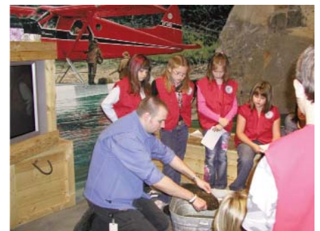
Figure 9. Panning for gold at a 'mineral exploration camp'.

Public Lectures are a free and regular feature at the GEO CENTRE, and those presented to commemorate the International Year of Planet Earth (IYPE) have been especially well attended (speakers have come from the St. John's geoscience community, the Geological Survey of Canada, and even internationally, e.g. Dr. Robert Ballard, scientist emeritus, Woods Hole Oceanographic Institute). The general public and students are also invited to a series of Special Events hosted by GEO throughout the year. These include Earth Day celebrations (featuring, for example, 'Stump a Geologist', 'Panning for Gold' (Fig. 9), and solar observations guided by members of the St. John's chapter of the Royal Astronomical Society of Canada); a bridge-building competition sponsored by National Engineering and Geoscience Week; and 'Doors Open St. John's', an event during which the GEO CENTRE and other museums and institutions in the city offer a free exploration of exhibits and facilities. Finally, GEO renews interest in its mission and complements its permanent galleries by hosting Travelling Exhibits , mostly during the off season. These are displayed in the Celestial Gallery, new space developed at the entry level and leading off the main entrance. Some of these temporary exhibits have enjoyed corporate sponsorship and helped generate valuable media interest. Exhibits hosted to date include: Dinosaurs and Company, From Crystals to Gems, and Arctic Adventure.