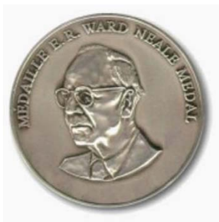
Figure 5. The E.R.W. Neale Medal of the Geological Association of Canada.