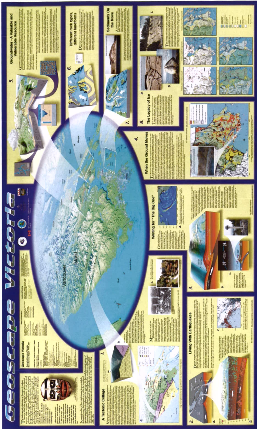
Figure 5 Geoscape Victoria (reduction of 90 x 156 cm poster; Yorath et al. , 2001).