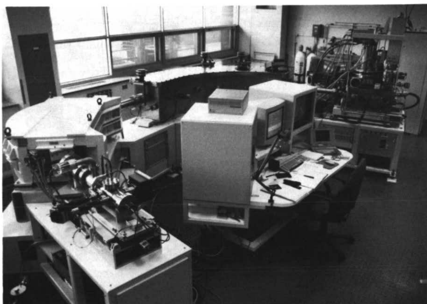
Figure 1 Overview of the Geological Survey of Canada's new SHRIMP II ion microprobe in the ground floor laboratory at 601 Booth Street, Ottawa.

Over the past 15 years, both SHRIMP I and later SHRIMP II have proven highly successful performers throughout a