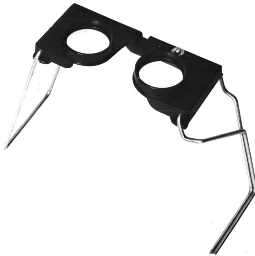
Figure 2 Pocket stereoscope with cut-away leg.

referring to the use of single photographs, and also that he did not study photographs stereoscopically as a matter of routine. Stereopairs of aerial photographs usually produce exaggerated relief (Matthes, 1928), and because of this, it is not true that an observer with normal stereoscopic vision can see as much from the aeroplane as he can on the corresponding stereopair of photographs.