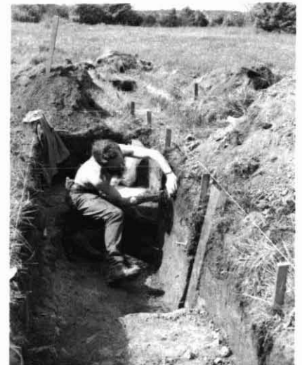
Figure 1 Soil sampling at an archeological site

The preservation of the remains of physical structure in the ground such as post holes, pits, and hearths, together with the artifactual material within soils, undoubtedly facilitates archeological interpretation, but perhaps even more important is the fact that the soils presently covering archeological sites also contain a chemical record of past human activities.