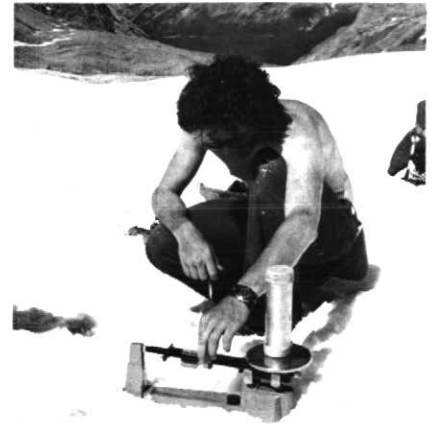
Figure 1 Snow density determination, Peyto Glacier.