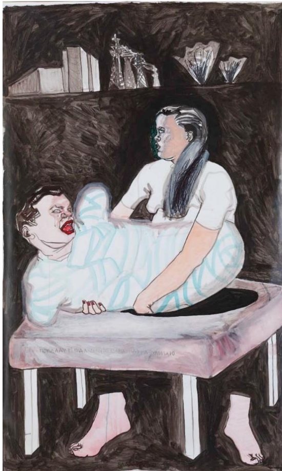
Figure 3. Vlada Ralko, from the Prykhystok poeta (Poet's Refuge) cycle, part of Kyivs'kyi shchodennyk (Kyiv Diary series) , the artist's version of the original, 2014, acrylic, permanent marker on paper, 200x120cm, courtesy of the artist.

The infant-soldier motif is a transformation of the torso theme in Ralko's work that was instigated by the war. According to the artist, what were formerly antique allusions to the armless Venus were replaced by associations with icons of dormition scenes in which saints' bodies are protectively covered with cloth and insect cocoons that in their ambiguity may harbour either life or emptiness (Ralko). The passive immobility of the swaddled figure echoes the incomprehensible violence of war.