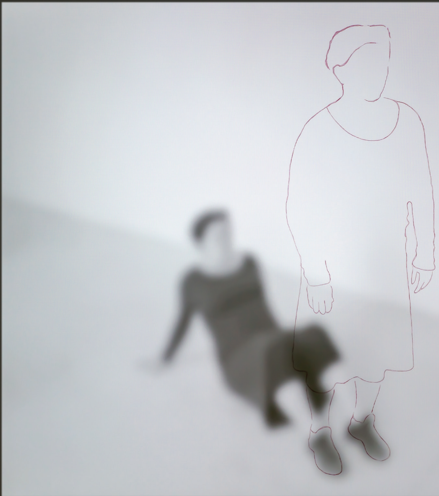
Manon Labrecque, apprentissage , 2015. Installation: HD video, black and white, 5 min 56 s. Drawing on wall.