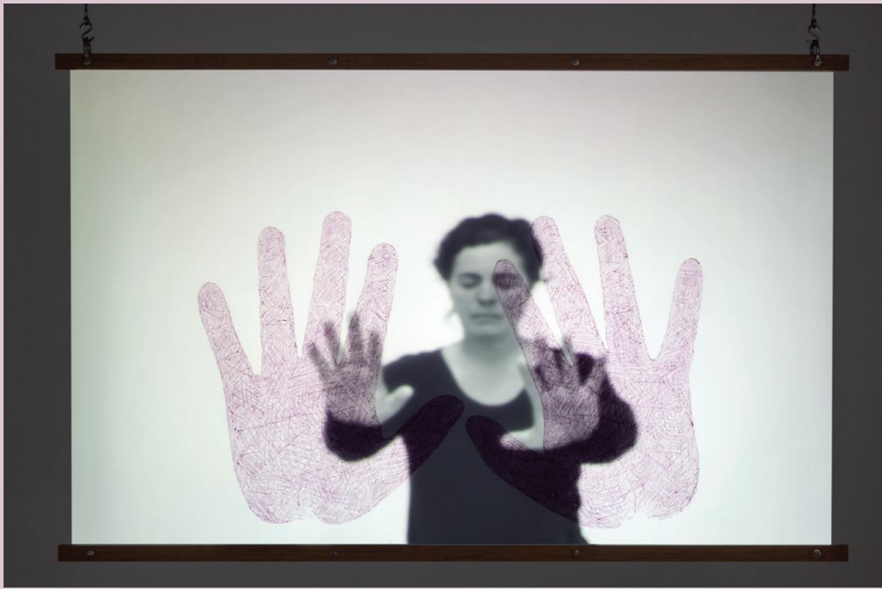
Manon Labrecque, touchée , 2015. Installation : vidéo HD, noir et blanc, 4 min 50 s. Dessin sur papier calque.