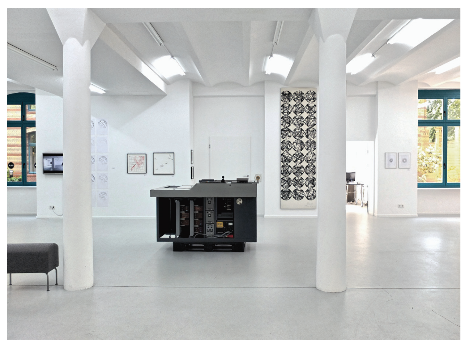
Aesthetica, view of the exhibition at DAM Gallery, Berlin.

is the device itself, not the drawings it makes: the collector or curator may give these drawings away, they may exhibit them as a pile on the floor or hang them neatly on the walls." Finally, both Casey Reas and Manfred Mohr conceive their work both as generative software, displayed on a screen, and plotter drawings. Manfred Mohr explains that displaying his compositions as an ongoing process was motivated by the need to communicate their increasing elaborateness: "I realized that the complexity of my work rose to a point that I could not communicate to the viewer this content in an easy visual way. I decided to render