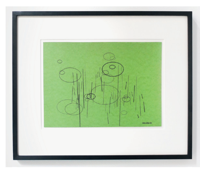
Aesthetica, Frieder Nake, 7.4.65 Nr. 1+6, 1965. Ink on paper. Zuse Graphomat Z 64.

ings, and bringing an original Zuse machine to the gallery, speaks of the intention to give the early works a proper environment that highlights their historical value and moves away from the more flashy and superficial aspects of media art, which, as Sommerer and Mignonneau state, is "an ephemeral field that is obsessed with novelty and change." <sup>14</sup> DAM is probably the only gallery that could set up an exhibition like Aesthetica , given Wolf Lieser's expertise and outstanding support of the pioneers of computer art. Lieser has stated that it was precisely the lack of