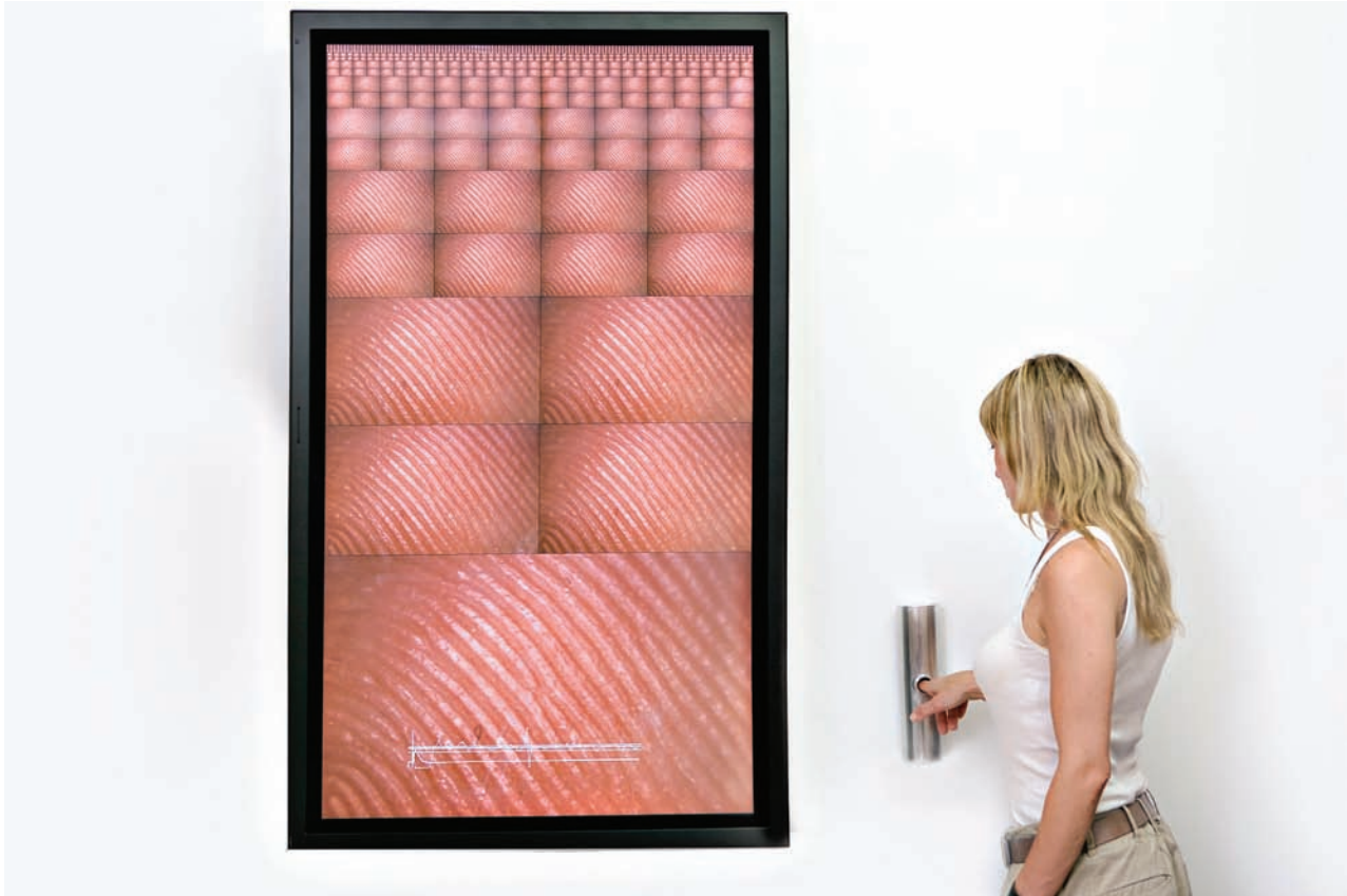
Rafael Lozano-Hemmer. Pulse Index , 2010. 147. 3 cm, plasma screen, computer, digital microscope, industrial camera, metal enclosure, custom software.