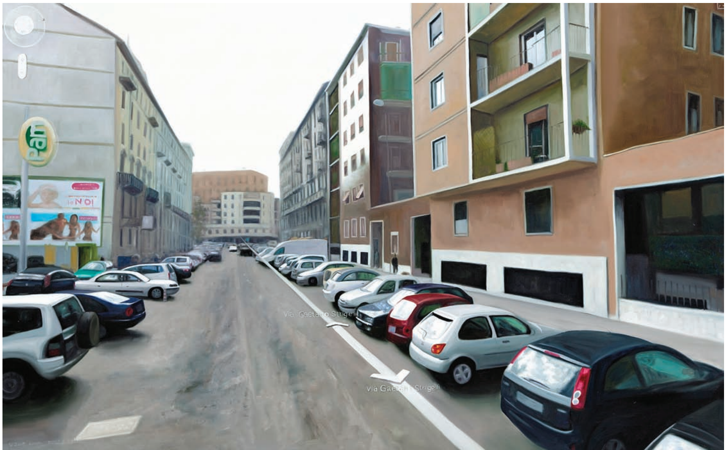
Carlo Zanni. Self-portrait with dog , 2010. Oil on canvas. Triptych, each panel 150 x 250 cm.