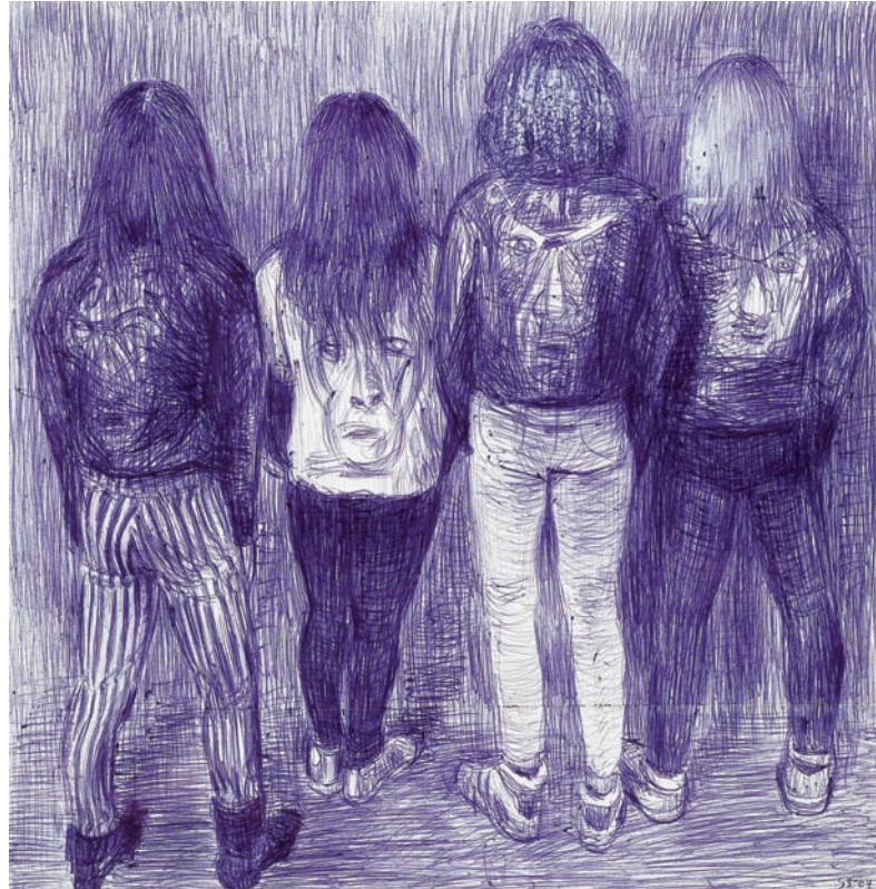
Steven Shearer, Group , 2004. Ballpoint pen on paper; 28 x 28 cm. Courtesy the artist; Galerie Eva Presenhuber, Zurich; Private Collection, Switzerland. © the artist.

the distinctive style, attitude, tastes and subjectivity of metal culture, his project ultimately suggests that his subject matter's value—that is to say, for which it is appreciated by its many fans and musicians 29 —is insufficient. Rather, as is the case with folk expressivity, its worth is amplified by being found and reframed, curated and collected within an official art context.