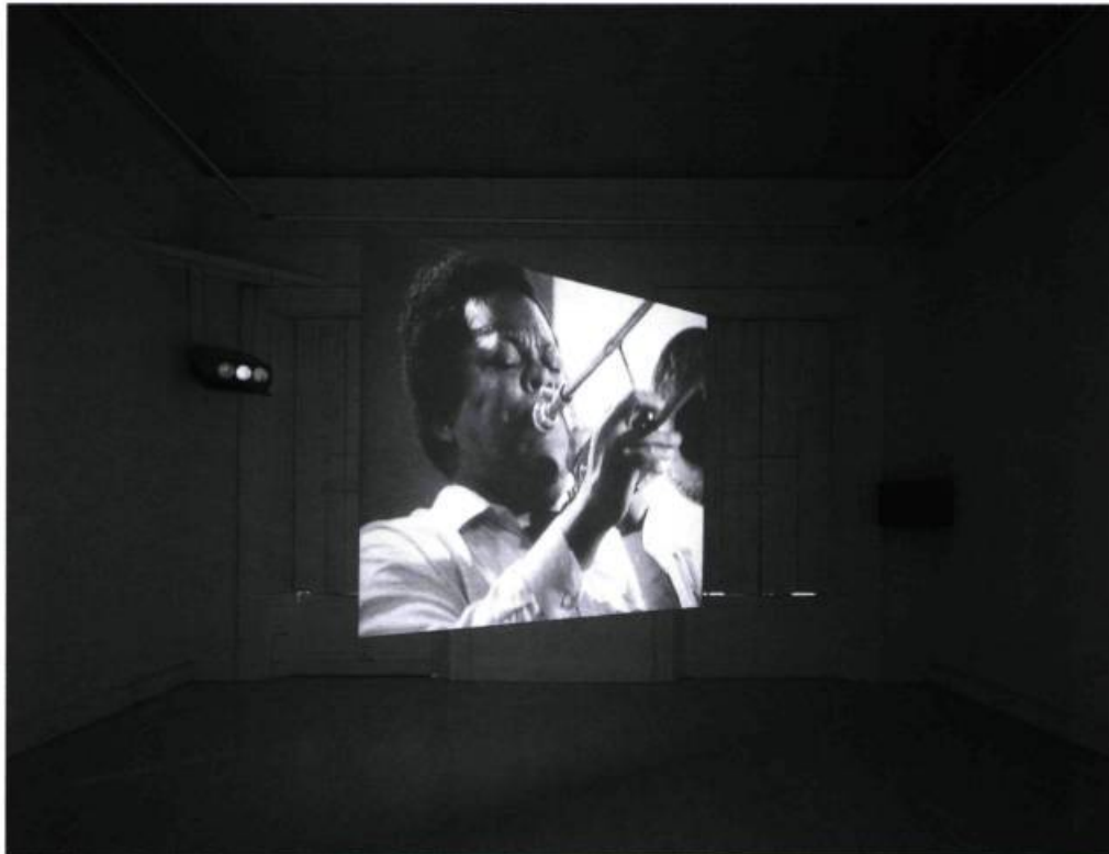
Stan Douglas, Hors-champs , 1992. Installation, photograph by Stan Douglas. Courtesy Vancouver Art Gallery.

Stan Douglas, Vancouver Art Gallery. February 27 - May 24 1999. The Edmonton Art Gallery (June 25 - August 24 1999), The Power Plant (September 24 - November 21 1999) 1