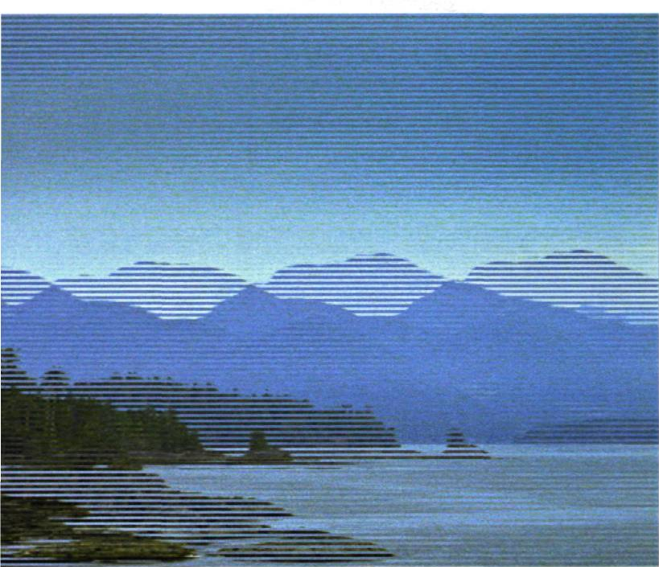
Stan Douglas, Nu.ka , 1996. Video still.

sides of the picture is metaphorically consistent with the era's call for choosing a stance and a place.