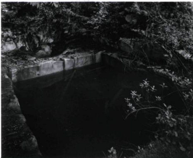
Stan Douglas, Marble Quarry at Hisnit Inlet, extrait des séries Nootka Sound, 1996. Colour photograph.

Hors-champs (1992), the earliest work in the exhibition, uses an irreconcilable split of vision as an emblem of the socio-political divides of the middle of this century. Projected on one side of a screen bisecting the room is a 1960s-style television presentation of a jazz quartet improvising upon a composition (Albert Ayler's 1965 Spirits Rejoice ) that includes references to gospel and the heraldic Marseillaise. Since the program was shot with two cameras, there exists an exact excised double of the edited program, looser and more revealing, which is projected simultaneously on the other side of the screen. The American musicians were all connected to the Free Jazz movement in France, which was in turn associated with the socialist student movement and, in the United States, with Black nationalism. In the installation, Douglas establishes a structural duality in which one's physical inability to view both