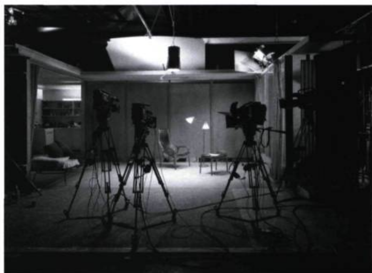
Stan Douglas, Set for Win, Place or Show (East View) , 1998. Colour photograph.