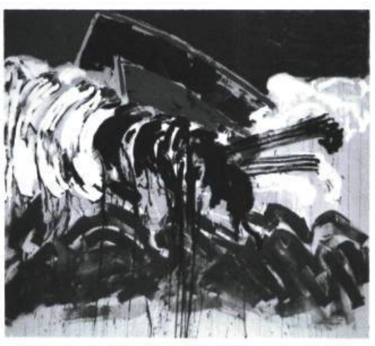
Richard Mill, Sans titre 1352 no 2. Acrylique sur toile; 193 cm x 213 cm.

Un des tableaux (RM 1359 1991) qui a sensiblement la même problématique que l'estampe exposée, comprend dans le haut, des touches larges et horizonta-