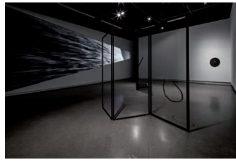
Antonia Hirsch Exhibition views, Negative Space, Gallery TPW, Toronto, 2015.