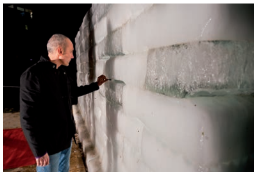
JANEZ JANŠA, THE WAITING WALL, NOVO MESTO, SLOVENIA, 2011.