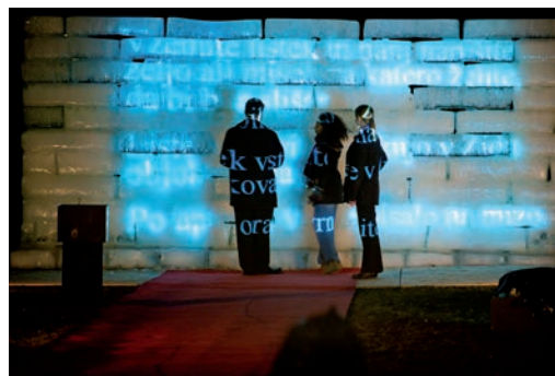
JANEZ JANŠA, THE WAITING WALL, NOVO MESTO, SLOVENIA, 2011.