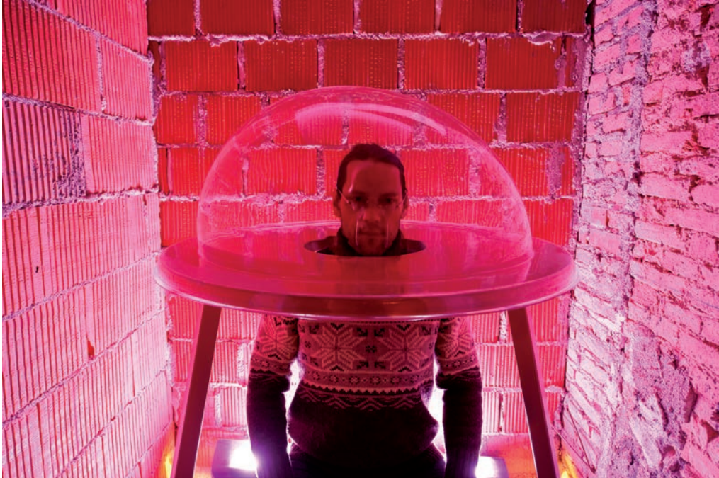
JANEZ JANŠA, THE WAILING WALL, NOVO MESTO, SLOVENIA, 2011.