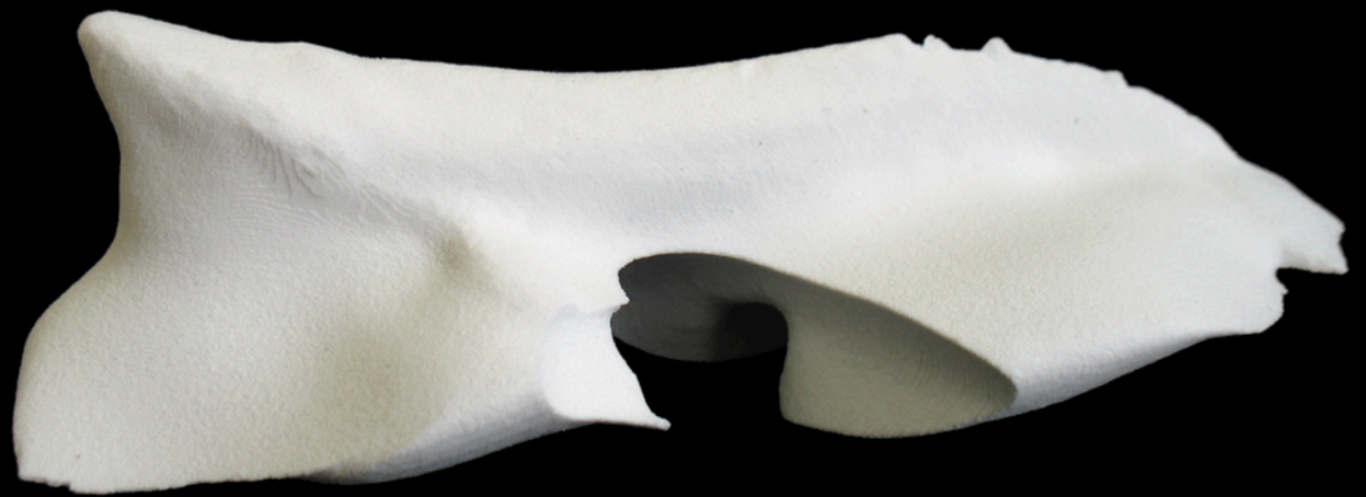
Erika Lincoln, HammerCloud , 2014. 3D scanned and 3D printed sculpture, gypsum powder and binder, silver paint, 360 x 200 x 140mm. Photo: Erika Lincoln. Erika Lincoln, WhaleCloud , 2015. 3D scanned and 3D printed Blue whale model, gypsum powder and binder. Dimensions: Scalable. Photo: Erika Lincoln.