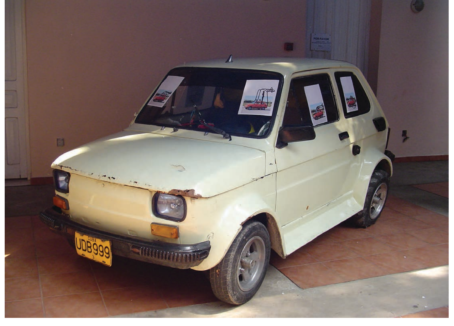
Esterio SEGURA, Submarino hecho en casa, 2012. 11ª Bienal de La Habana.