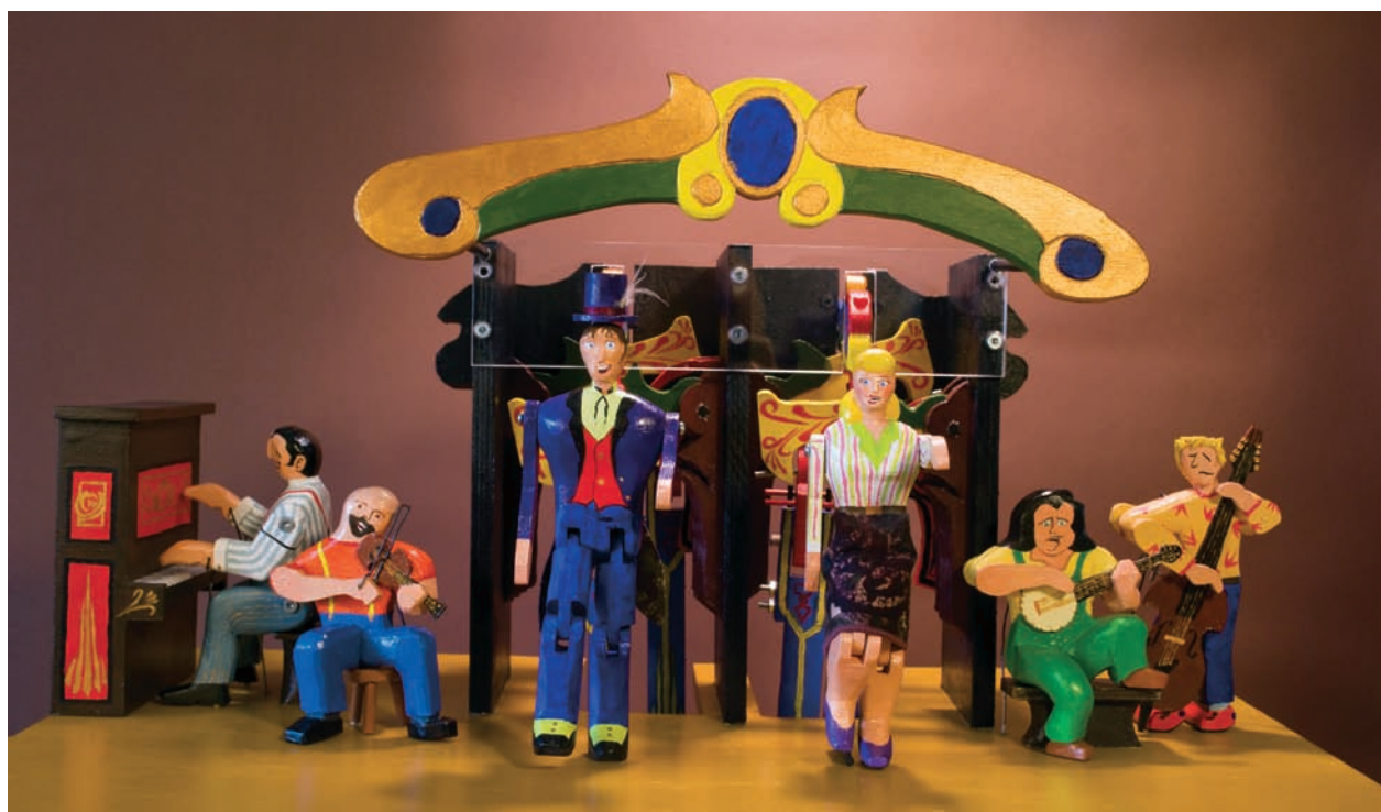
Jessica FIELD, The Musicians , 2011. Wood, metal and plastic. 60 x 90 x 45. Photo: courtesy the artist.

→ Jessica FIELD, Field Studies: Protozoan Flagellates , 2009. Solar panels, electronics, and metal. Photo: courtesy the artist.