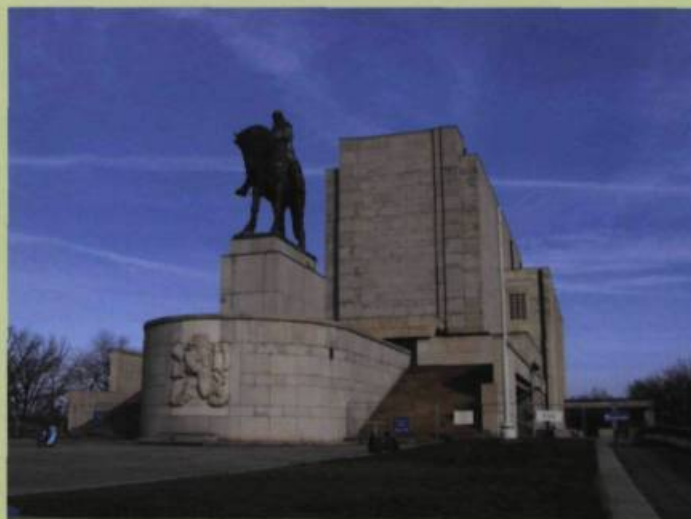
Bohumil KAFKA, Jan Zizka monument, ca. 1950. The statue itself is 9 meters high; height including pedestal is 22 meters. Prague.

Kafka's statue was ceremoniously erected on July 14, 1950 within a far different ideological context than that of its initial conception. Following their 1948 coup d'état, the communists commenced an Orwellian rewriting of Czech history. Stalin's party line was amenable to Zizka as a secularized symbol of Pan-Slavic