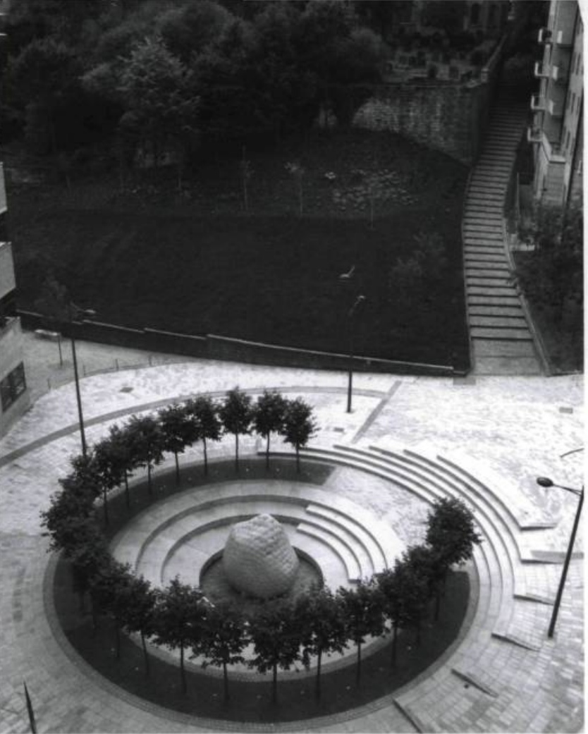
Peter RANDALL-PAGE, Give and Take , 2003. Glacial granite boulder. 345 x 295 x 261 cm. Enabled by Sculpture at Goodwood. Give and Take was permanently sited within an amphitheatre of hard landscaping, designed by the artist in collaboration with the landscape architect Ros Southern, in Trinity Gardens, Newcastle, UK, 2005. Winner of the 2006 Marsh Award for Public Sculpture.

I suppose this particular way of working came from looking at nature. Studying its forms and patterns. I began to realise that while one can see the underlying geometry in nature it is never absolutely rigid; there