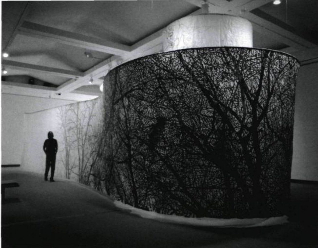
Ed PIEN, In a Realm of Others , 2005. Detail.

The exhibition is both playful and psychologically intense. One must enter a corridor of tissue-like fabric, which is actually quite sturdy glassine. Seemingly fragile, it parts merely by the air currents generated as one's body moves through the space. This diaphanous, wafting tunnel is suggestive of the underworld, or an intestinal passage, or perhaps even a funhouse. The accompanying groans and shrieks turn out to be the sounds of children videotaped while making spooky noises. Above one's head is a disk projecting the image of merging and diverging treetops, a kaleidoscopic mimesis of deep forest. At the end of the corridor is an outer and inner chamber, and positioned in the final cavity is a monitor broadcasting a series of individual children making menacing faces. Some are adorable, huggable and cute, while the odd one has been photographed at such an angle that