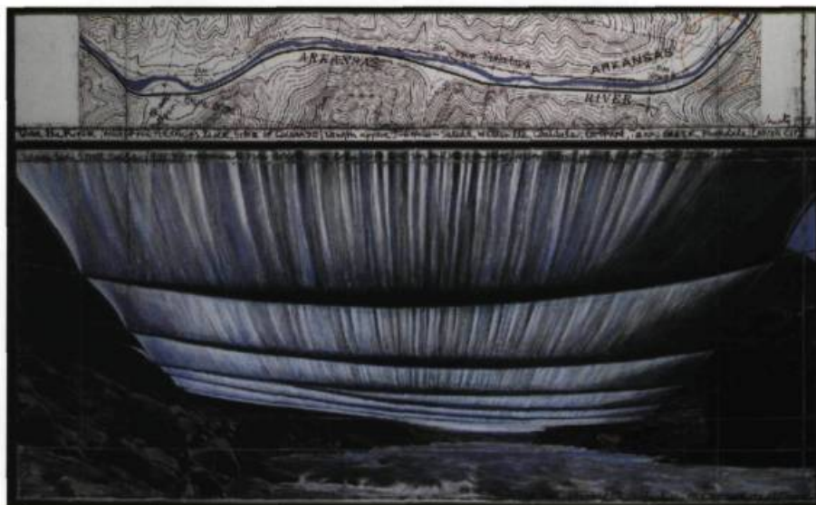
CHRISTO, Over the River, Project for the Arkansas River, State of Colorado. Drawing in two parts, 1993. Collection of George Weston Limited.