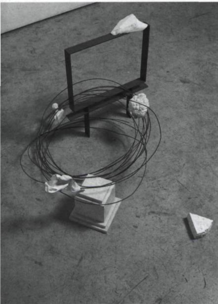
CLAUDE MONGRAIN, Blizzard , 1992. Stone, steel, plastic. 60 x 100 x 150 cm. Collection of the artist.