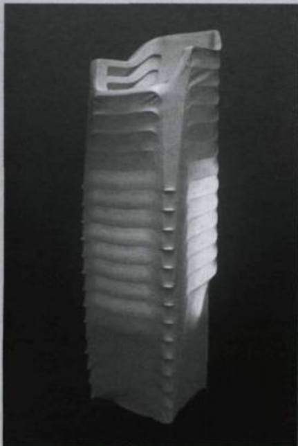
BRIAN JUNGEN, Mise en scène , 2000. Plastic, polyethylene, fluorescent lights. 128.3 x 37.5 x 34.3 cm.

poetic that marks his best art. Mise en scène begins with fourteen children's size molded plastic chairs stacked together and wrapped in a tight cocoon of polyethylene sheet. Inside this columnar package burns a fluorescent light discernible through the wrap. Now, Jungen has done truly interesting work using plastic chairs before — Cetology or Shapeshifter , two pieces in which he brilliantly used them to construct large-scale sculptural renditions of whale skeletons, come immediately to mind. But Mise en scène is representationally indifferent, and insufficient as any kind of evocation —