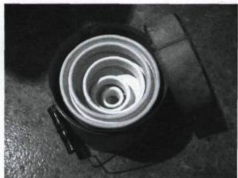
PANYA CLARK ESPINAL, The Facilitator , 2003. Metal butter bucket, wood, latex paint. 19.3 x 17.2 cm. Diameter.