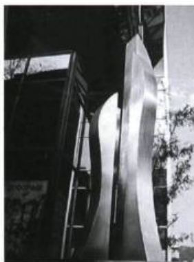
MURICE LEMIEUX, Enterspace , 1980. Sculpture acier inoxydable 18 pieds de haut (4 éléments). Canderel Ltd. (I.A.T.A). Édifice 2000 Peel, entrée station de métro Peel, Montréal.

d'Iberville (Saint-Jean) ; l'Hôpital général de LaSalle (Montréal) ; l'Institut des Arts Appliqués (Montréal) ; le Centre récréatif de Pointe-Saint-Charles (Montréal) ; l'École Technique d'Asbestos (Asbestos) ; l'École élémentaire Champlain (Candiac) ; l'église Saint-Cyrille-de-Normandin (CtÉ Roberval) ; l'Édifice 2000 Peel, entrée métro Peel (Montréal) ; la station de métro de La Savane (Montréal). ←