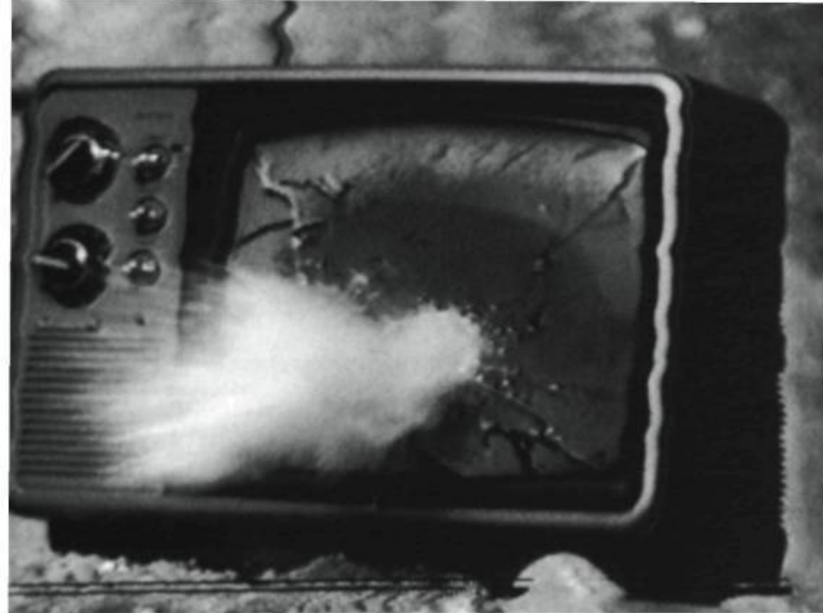
Bill Burke, Untitled Performance Document (Harold Eggerton meets Hunter S. Thomson) , 1999. Varied dimensions. Performance using magnum .45 and TV.