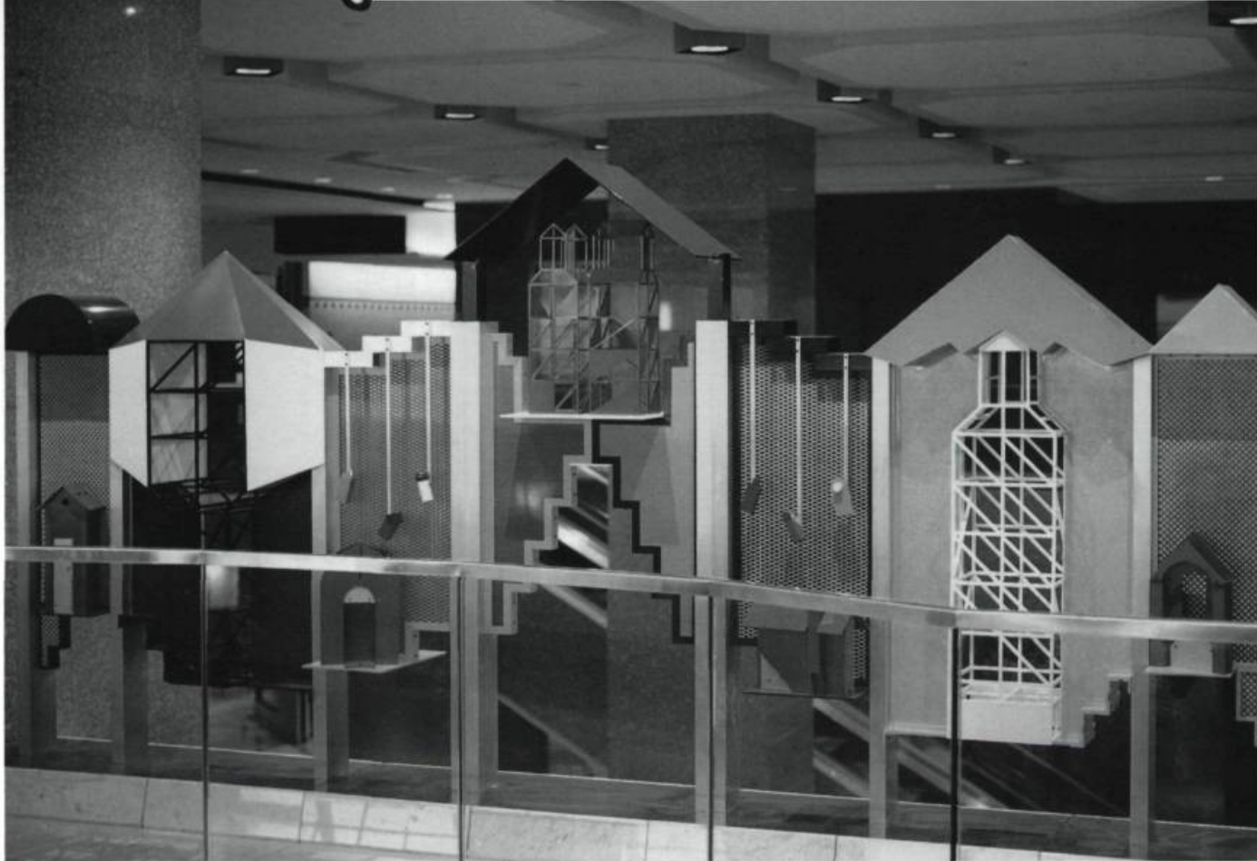
Ron Kostyniuk, Memories , 1989. Aluminum with enamel/Aluminium peint. 228,6 x 518,16 x 40,64 cm. Amoco Tower, Calgary, Photo : R. Kostyniuk.

“visual analogs of cell structure”, while others were based on inorganic forms as minerals.