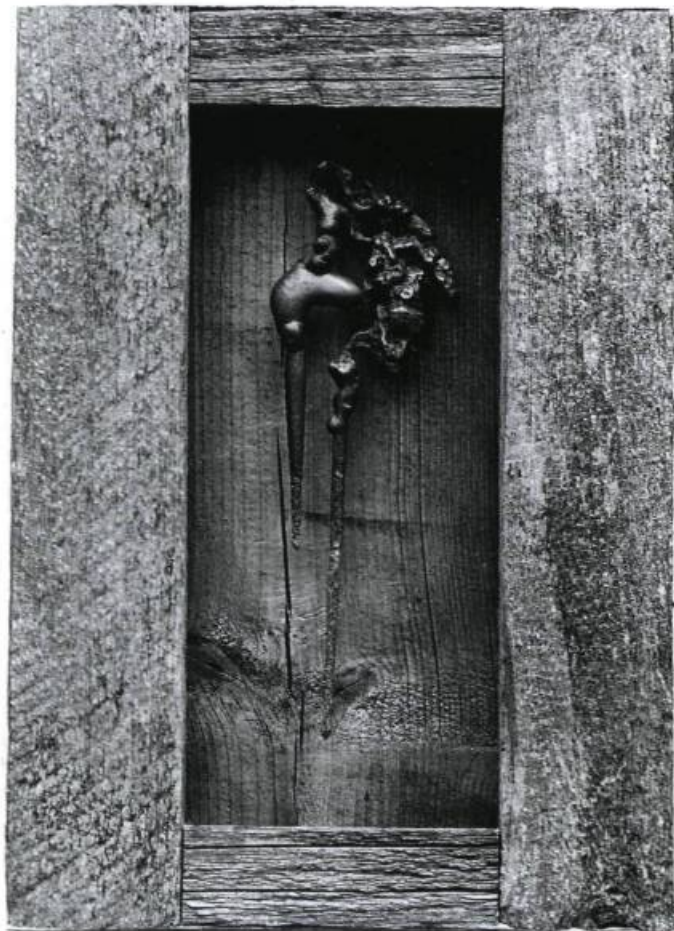
Pierre Racine, Passage , 1993. Bronze, wood. 33.02 x 22.86 x 7.62 cm.

Although Racine broke the standard stereotypes associated with paper art — the