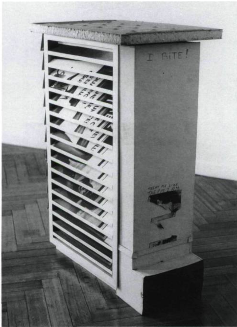
Robin Collyer, Louver , 1992. Aluminium, plastic, colour photocopy, ventilation duct, polyurethane. 133 x 96 x 56 cm. Galerie Arlogos, Nantes.

In the semiotic mode of analysis, signs are fragments in a shifting Text and with their assembly into the syntactical context of a work of art, they become tools for showing relationships of power in society. The fact that these images also exist in consciousness in an emotional or affective way as a dimension of communication seems less important. For this reason, some of the images that deal