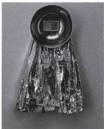
Ted Rettig, Insatiable simultaneity in two parts , 1991 (detail). Mixed media installation.

Wynick / Tuck Gallery, Toronto September 12 – October 17