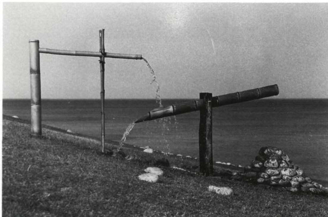
"Zo" team, Shi Shi Odoshi, 1988. Waterworks, Toronto.