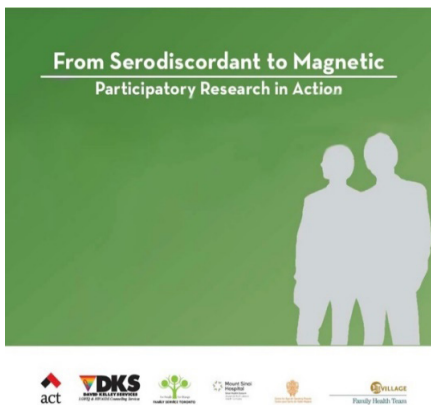
Figure 1. Magnetic Couples study

A modified narrative approach was used to describe four CBPR studies that I completed between 2014 and 2019 (Moen, 2006). I focused on cataloguing the strengths and limitations of community engagement as I reviewed my past projects and synthesized the findings against CBPR framework criteria to provide reflection for CBPR researchers as a society with evolving culture and practices. This section details each of the four studies. Community engagement strengths and limitations are synthesized in the following section.