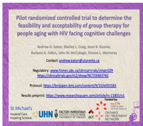
Figure 4. HAND Randomized, controlled trial (RCT)

These projects are part of my overall program of research to develop community-based interventions to address the complexities of living and aging with HIV. As illustrated in Figure 5, I attempt to mitigate such complexities (hospital discharge, cognitive health, and intimate relationships) through the interventions described above. To advance my research program, I assess these studies' results, consider how to adapt, scale, and implement these interventions, and evaluate community engagement. This paper represents a bird's eye view of that community engagement evaluation, where I consider my research program's strengths and limitations, and how my lessons learned can influence the culture of CBPR researchers and investigators considering the use of community engagement techniques in their investigations.