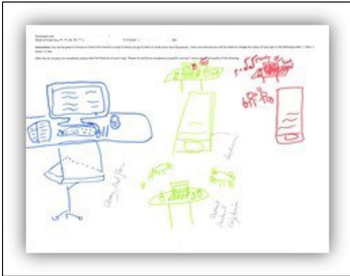
Figure 1 A cognitive map of the student's study spaces.