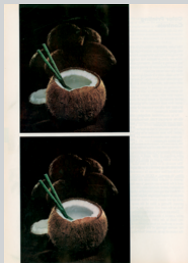
CC50G, 2016, colour print, 76 × 51 cm

Referencing the origins of photography, Bouabane uses a half coconut as a makeshift pinhole camera. His ostensible subject is the Canadian landscape, long mythologized by Canadian artists and synonymous with the creation of Canadian identity. But in Bouabane's analogue prints, the results are blurry and extremely expressionistic. Although engaging in their own way, the prints suggest the impossibility of ever finding a singular, coherent Canadian "voice" unmediated by discourse.