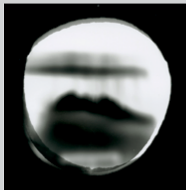
Mountain #1, 2015, silver print, 13 × 13 cm

An almost-life-size colour photograph, featuring the artist, questions the ethnographic narrative. The colonial subject of Laotian ancestry, represented by Bouabane's presence in the photo, stands proudly on a mountaintop with the Canadian Rookies in the background, approximating the modern-day selfie, with a coconut, mimicking a camera, mounted on a long wooden