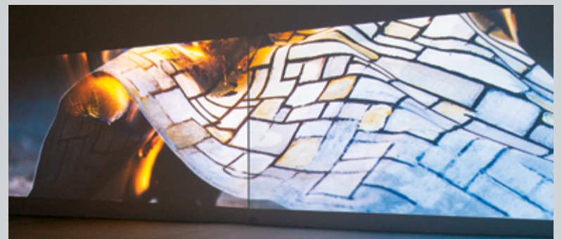
La vie abstraite 1 : le temps transformé , 2015, 2 projections vidéo synchronisées; La vie abstraite 2 : espace du silence , 2016, 4 projections vidéo synchronisées, 6 m ch., 30 min, photos : Pascal Grandmaison, permission de la Galerie René Blouin

Ce n'est pas la première fois que la vidéographie sert à semblable entreprise de mise à distance critique d'un autre médium. Sauf qu'il pourrait être hasardeux qu'une œuvre non figurative aussi déterminante soit soumise à pareille épreuve critique, au moyen d'un médium qui sait si mal, de par sa nature, faire fi d'un certain naturalisme. Or, ici, tous les choix techniques faits pour filmer les contorsions de ce carré noir, que ce soit par l'entremise de l'angle choisi, de la lentille employée, du mouvement imprimé à la caméra, du réglage de la mise au point et de la profondeur de champ; tout, vous dis-je, concourt à la production d'une sorte de travail non figuratif, à la création d'images vaguement abstraites. Ce n'est pas qu'il soit difficile de ramener