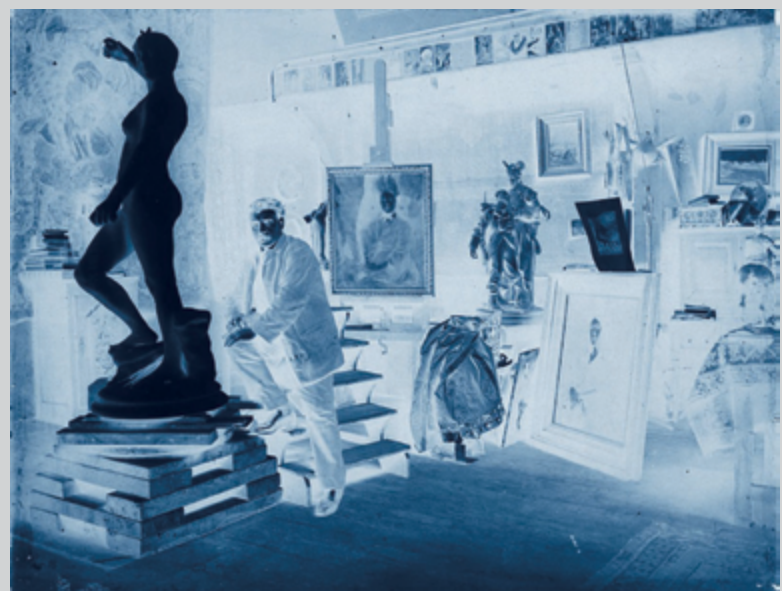
neg_artist_01 , 2014, chromogenic print with Diasec, 71 x 81 cm, courtesy David Zwirner, New York/London, © Thomas Ruff/SODRAC (2016)

The four images from Ruff's latest series, Press++ (2015), based on archival press images made originally for news media, entered the artist's collection via eBay. Once published on disposable newsprint, they are here transformed into monumental displays, both by their massive enlargement and by the choice of subject – masculine conquests, both military and astronomical, showing soldiers in battle, astronauts landing, and the equipment they play with. The once-discrete fronts and backs of the photographs are conjoined, making a