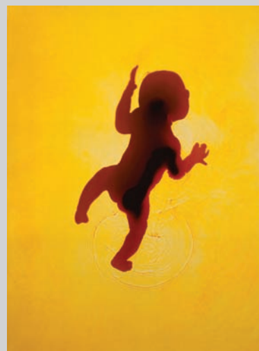
Adam Fuss, Invocation , 1992, unique cibachrome photograph, 101,6 x 76,2 cm, courtesy of Cheim and Read, New York

The best known of all camera-less photographers, Adam Fuss was attracted to application of the photogram outdoors. The world of nature becomes a theatre of life, expanding our place in the cosmos in