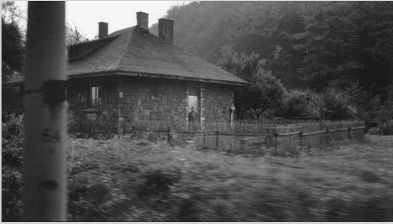
Serge Clément, Maison de Pierre / train Budapest-Istanbul, Hongrie, 2004, DVD, 12 min.