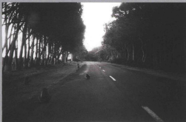
Wolfgang Tillmans, Tiere , 2005, C print, 144,8 x 213,4 cm, Courtesy Andrea Rosen Gallery (New York).

55th Carnegie International Pittsburgh, Pennsylvania, May 3, 2008–January 11, 2009