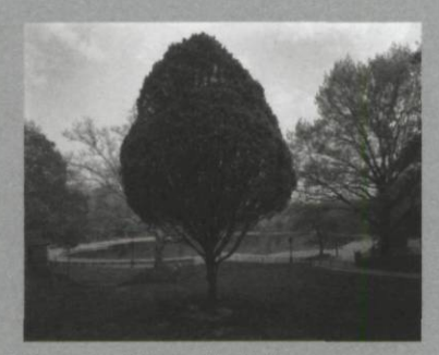
Conservatory Water, Looking North, Central Park, New York, 1994, Canadian Centre for Architecture, Montreal

James's Olmsted photographs represent a seven-year project to create a comprehensive series of images of Frederick Law Olmsted's landscape designs. Credited with the birth of modern landscape architecture, Olmsted is best known for public spaces such as Central Park in New York City and Mont-Royal in Montreal. Conceived to provide respite to the city dweller, his urban