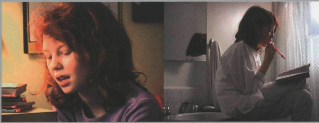
Kerry Tribe , Here and Elsewhere , 2002, Double projection DVD synchronisée, avec son, 10 min 30 sec

individuelles. Ces reconstitutions sont d'autant plus fascinantes qu'elles rendent visibles des déplacements temporels importants. Chaque nouvelle re-médiation des sujets ouvre une brèche entre ce qui était, ce qui fut et ce qui est. On se retrouve donc à scruter un passé composé, notre passé, d'un point de vue contemporain. Quelle forme ce présent prendra-t-il dans notre mémoire collective de demain?